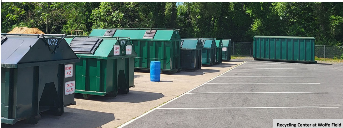
Recycling Center at Wolfe Field

Lewisburg Borough requires the separation of recyclables from refuse/rubbish at all residential, commercial, and institutional properties. Residents and property owners have several options for recycling in the Borough. Curbside collection of aluminum, glass, and newsprint only is conducted on the first Saturday of each month. These items must be separated by material type. Residents also have the option to contact a private hauler and pay for the collection of their recycling. Additionally, Lewisburg Borough operates a Recycling Center in the Wolfe Field complex on St. Anthony Street. Source-separated recyclable materials can be taken to the recycling center on Wednesdays from 8am-4pm & Saturdays from 8am-12pm.